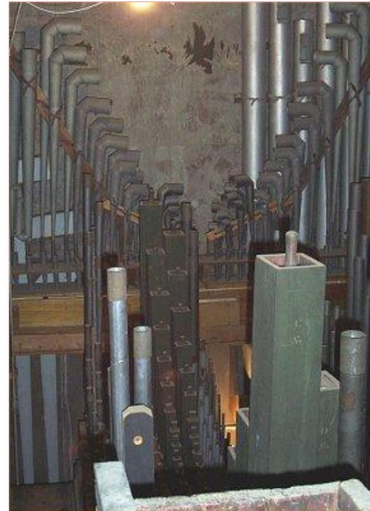
A view inside the organ chamber showing the hooded Tromba

Members were then invited to play the organ, and a wide range of music was heard to great effect on this comprehensive instrument. Soft drinks and biscuits were provided that allowed members to chat, the good social