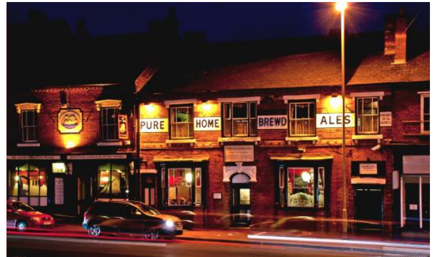
The Old Swan Inn, Netherton