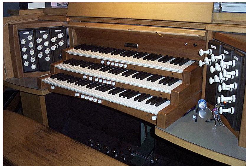
Console of the 1970 Hill, Norman & Beard at Carrs Lane