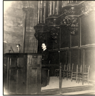
Vierne in the tribune of Notre-Dame de Paris